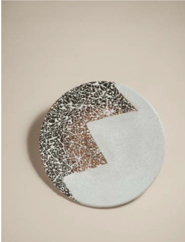
Plate, earthenware with white enamel dripping, partly covered with white cracked enamel c. 1930, Manufacture CAB h 2 in / dia 14 in