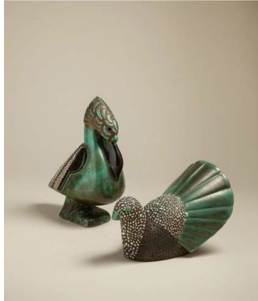
Pelican and Pheasant Hen , enameled earthenware c. 1930, Manufacture CAB, Primavera h 14 ½ in / l 10 in / d 6 ¼ in ; h 8 ¼ in / l 12 ¾ in / d 8 ¼ in