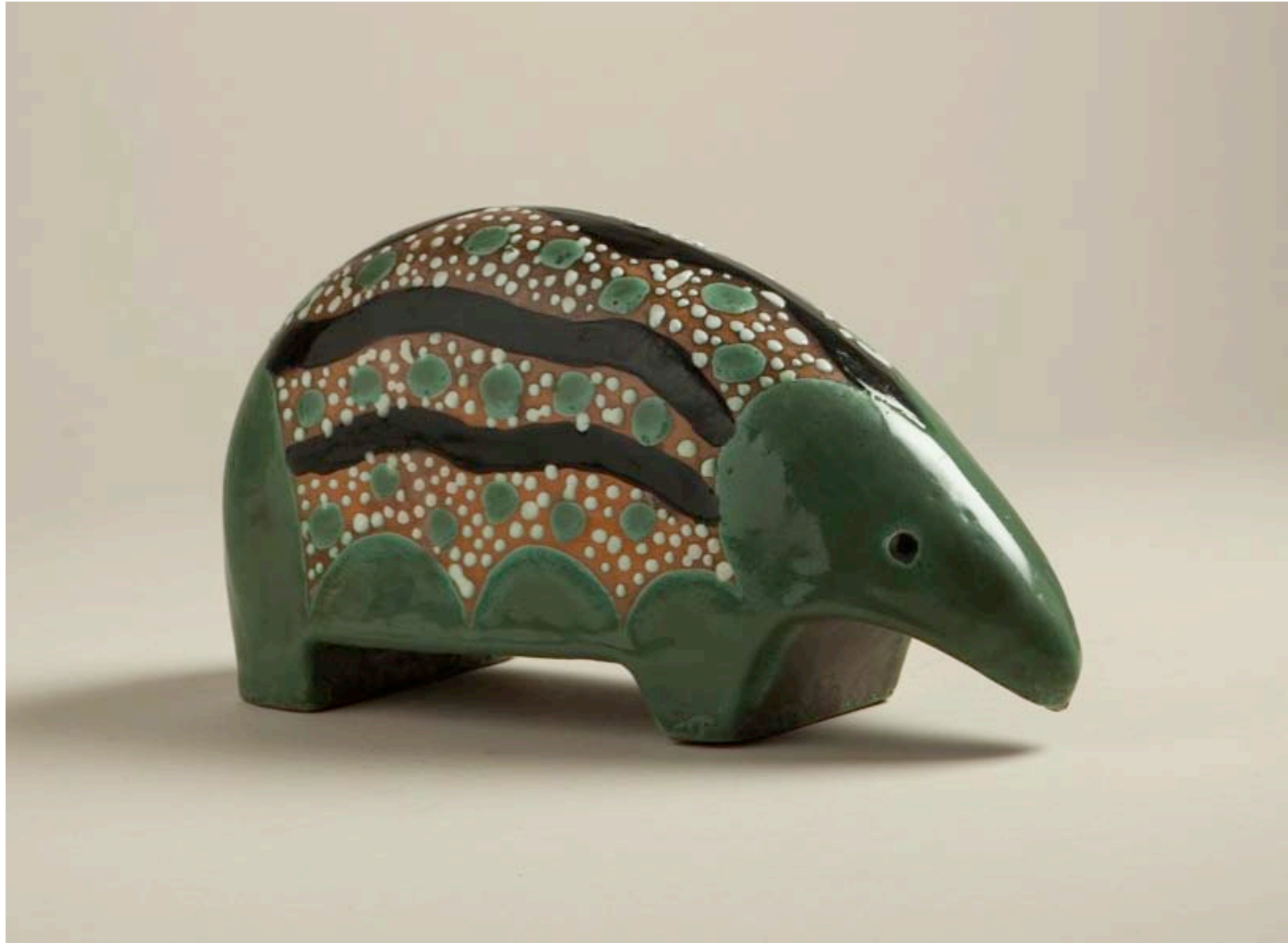
Tapir , enameled earthenware c. 1930, Manufacture CAB h 6 ¼ in / l 4 ¼ in / d 12 ¼ in