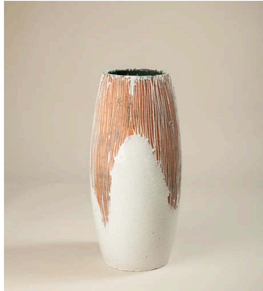
Vase , earthenware with enamel dripping, partly covered with white cracked enamel c. 1930, Manufacture CAB, Primavera h 19 \frac{1}{4} in / 19 \frac{1}{4} in