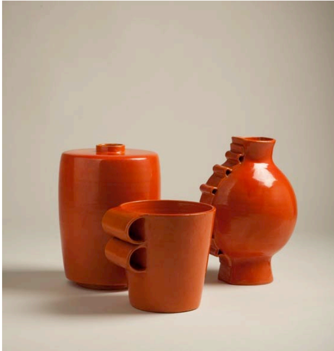
Three vases, orange enameled earthenware c. 1935, Manufacture CAB, Primavera h 12 in / l 9 in; h 7 in / dia 8 ¼ in; h 28 in / dia 9 in