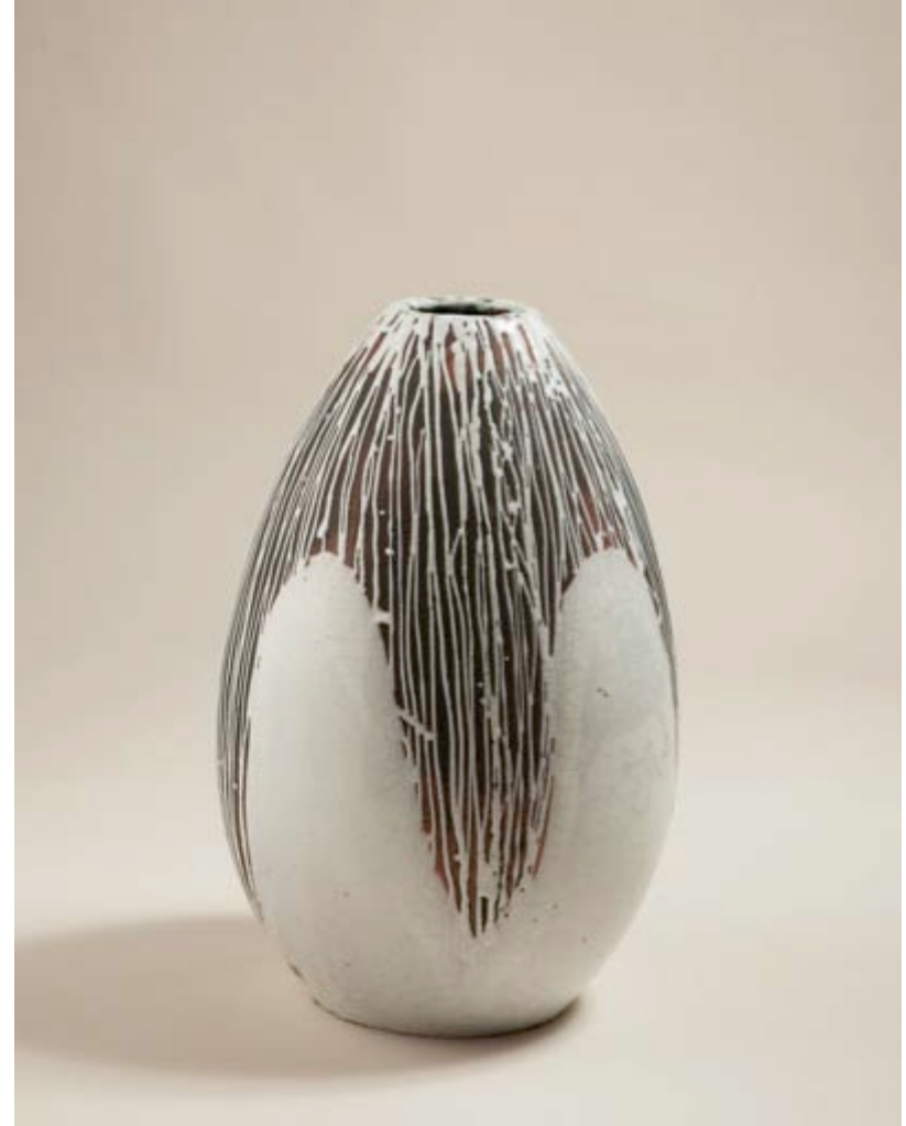
Vase, enamelled earthenware c. 1930, Manufacture CAB h 5 \frac{3}{4} in / 16 in