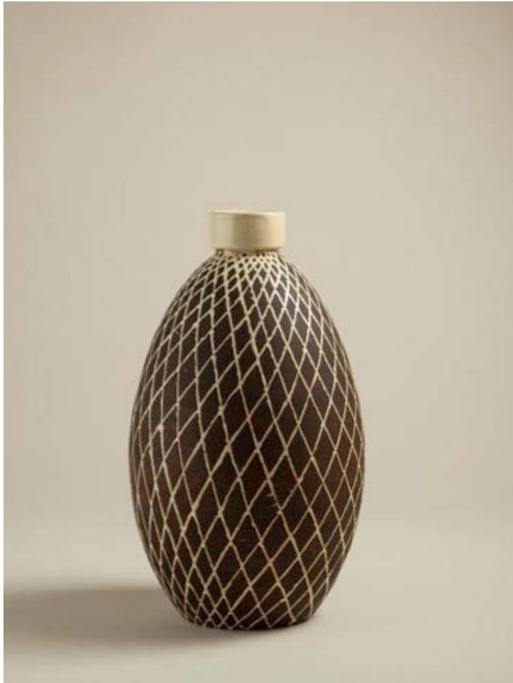
Vase, enamelled earthenware with fishnet decor c. 1930, Primavera h 16 \frac{3}{4} in / 19 in