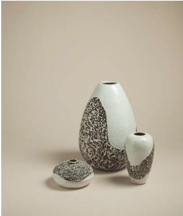
3 Vases, earthenware with dripped enamel, c. 1930, Manufacture CAB, Primavera h 11 in / dia 10 ½ in