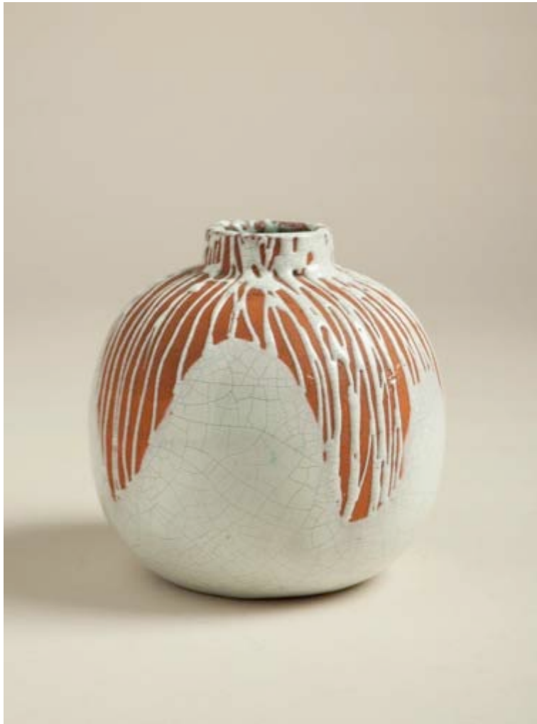
Vase , earthenware with enamel dripping, partly covered with white cracked enamel c. 1930, Manufacture CAB, Primavera, made in France h 5 \frac{3}{4} in / 16 in