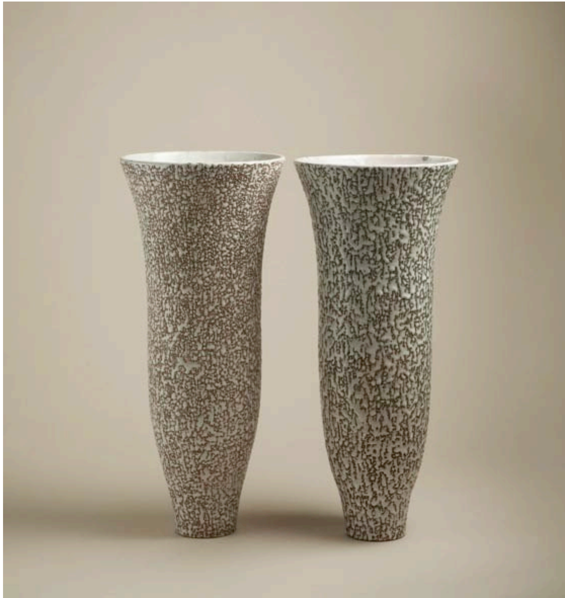
Pair of Trumpet vases, enameled earthenware c. 1930, Manufacture CAB, Primavera h 12 ½ in / dia 11 ¼ in