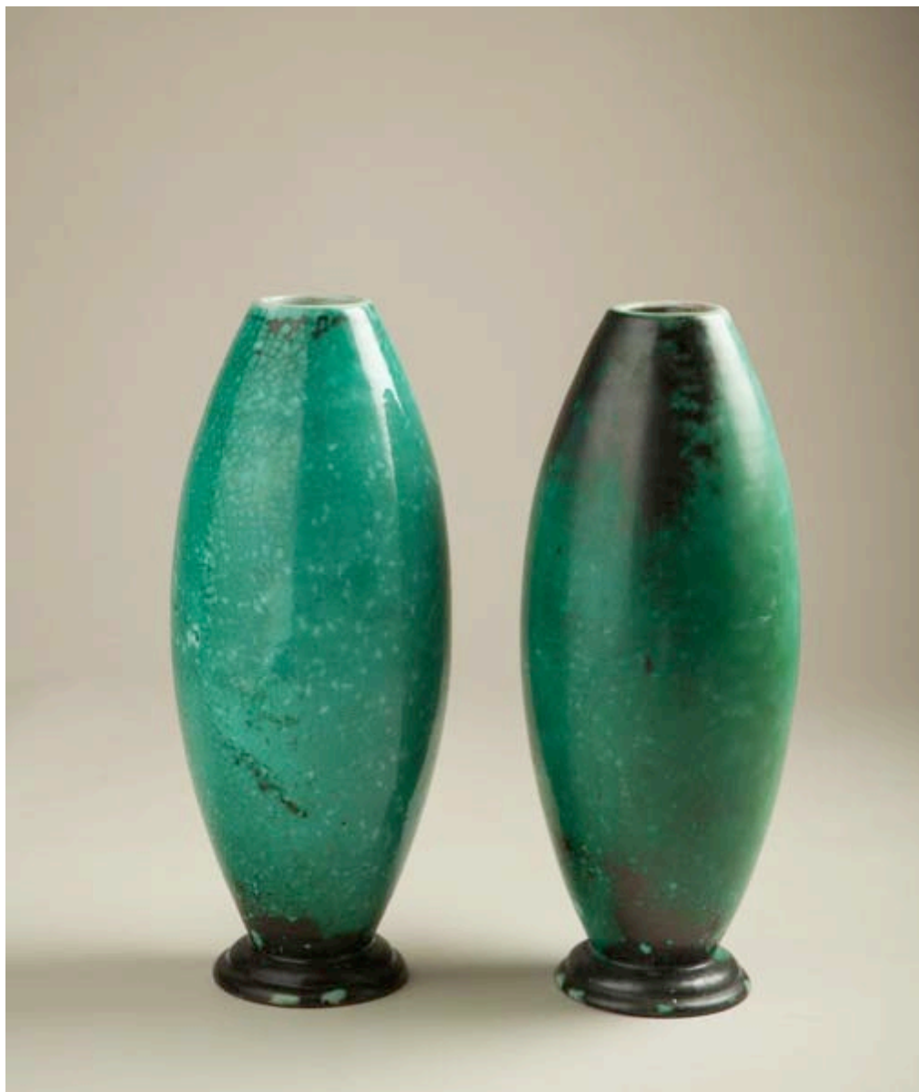
Three vases, earthenware with green enamel c. 1925, Manufacture CAB, Primavera h 16 in / 19 ¼ in; h 10 ½ in / 17 in; h 9 ½ in / 16 in