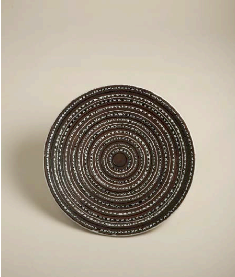
Dish, enameled earthenware c. 1925, Manufacture CAB, Primavera h 2 ½ in / dia 15 ¾ in