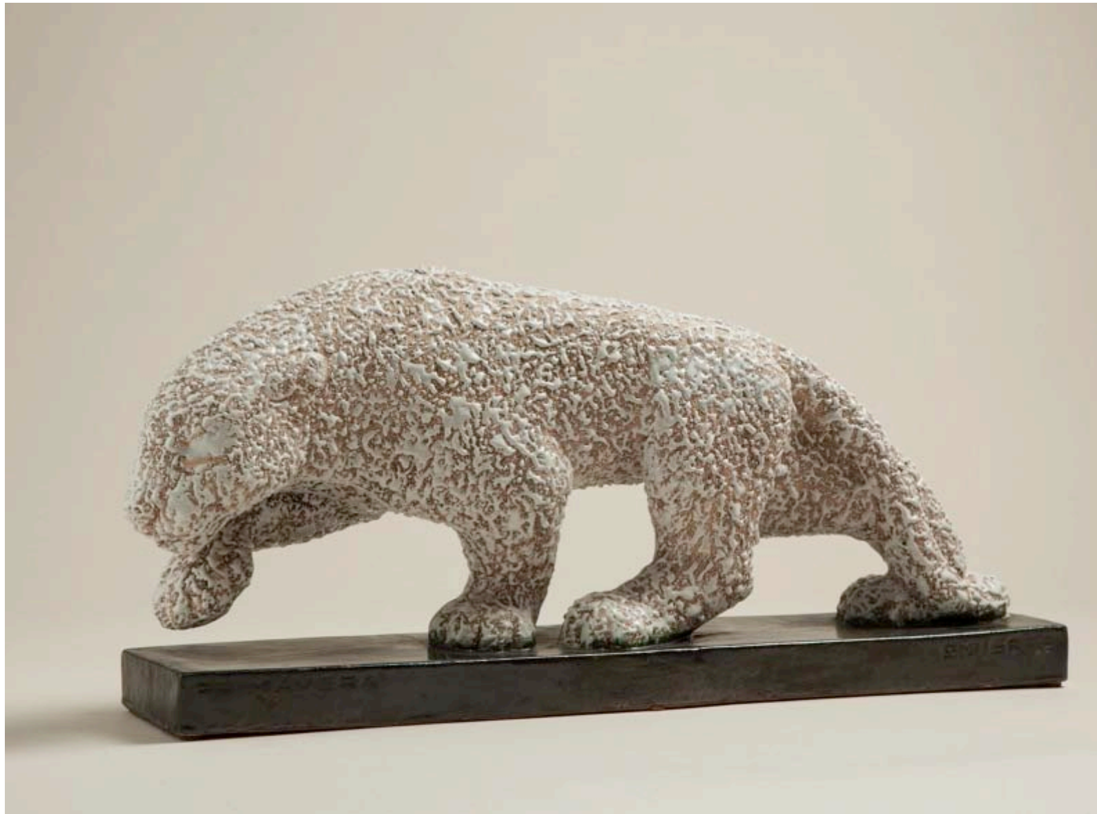
Panther , enameled earthenware c. 1930, Manufacture CAB, Primavera h 13 \frac{3}{4} in / l 28 \frac{3}{4} in / d 6 in