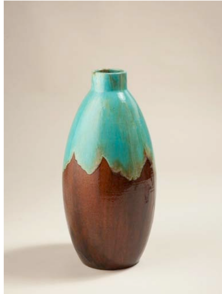
Vase, enamelled earthenware c. 1930, Manufacture CAB h 5 \frac{3}{4} in / 16 in