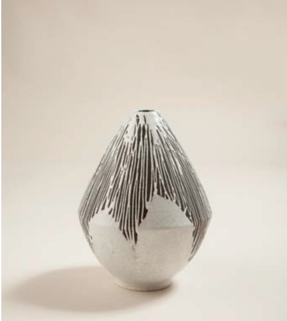
Conic vase, enamelled earthenware c. 1930, Manufacture CAB h 10 \frac{1}{4} in / 17 \frac{1}{4} in