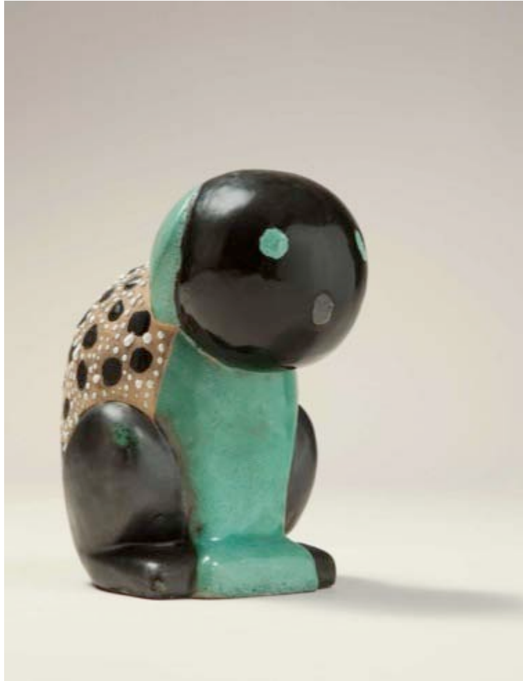
Dog , enameled earthenware c. 1930, Manufacture CAB h 8 ¾ in / l 7 ¾ in / d 5 in