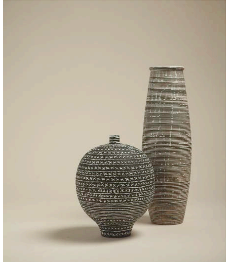
Vases, enameled earthenware c. 1925, Manufacture CAB, Primavera h 10 in / l 7 ¾ in