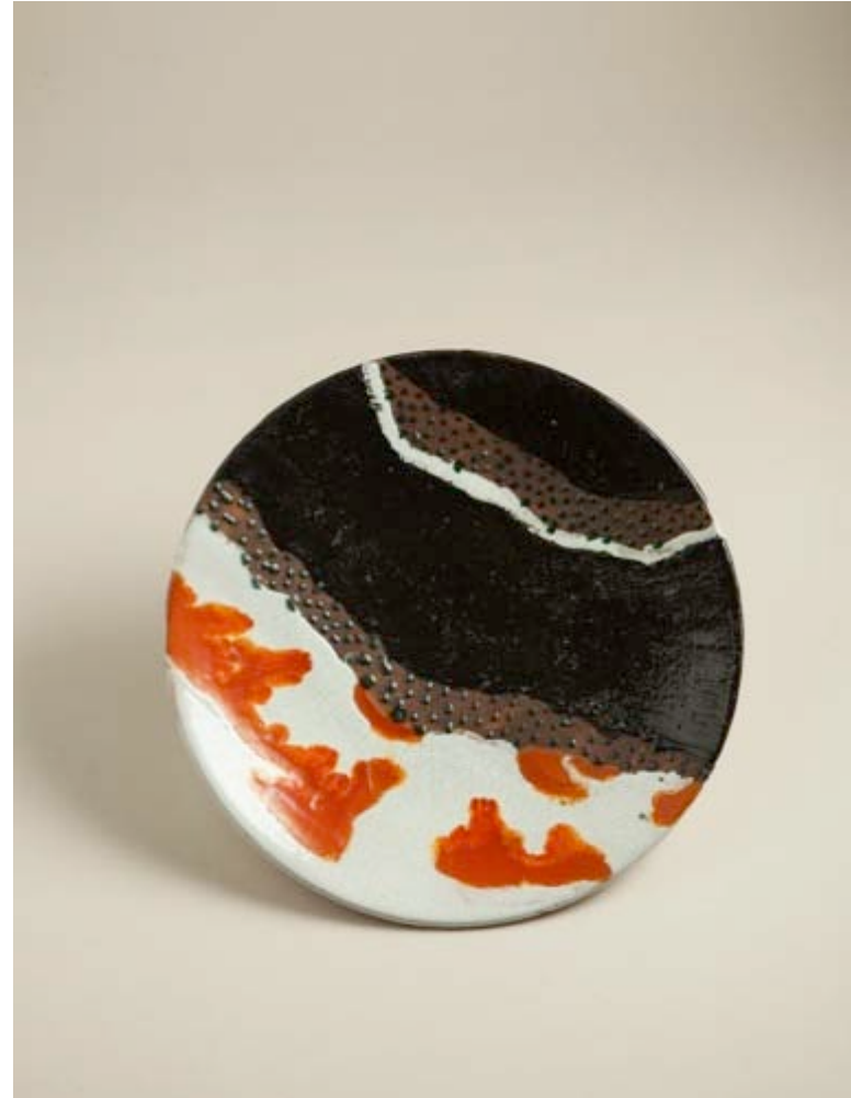
Plate, enameled earthenware c. 1930, Manufacture CAB h 8 ¼ in / l 7 ½ in / d 5 in