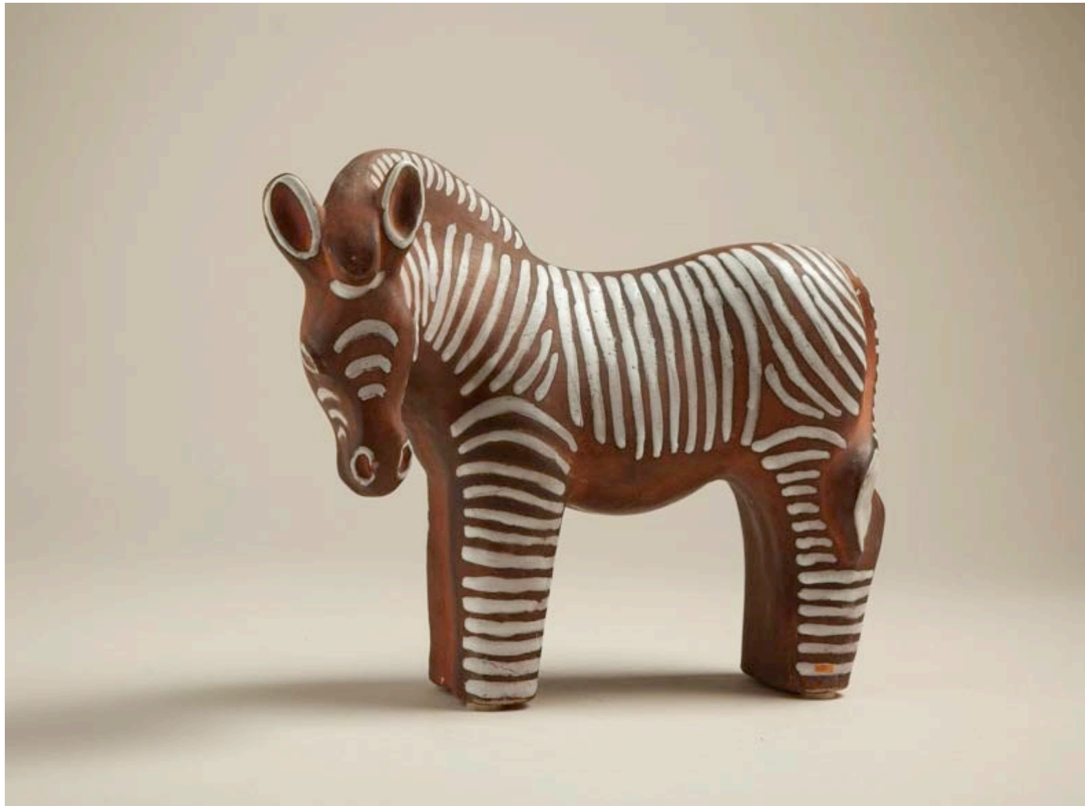
Zebra , enameled earthenware c. 1930, Manufacture CAB, Primavera h 11 \frac{3}{4} in / l 15 \frac{1}{4} in / d 6 \frac{1}{2} in