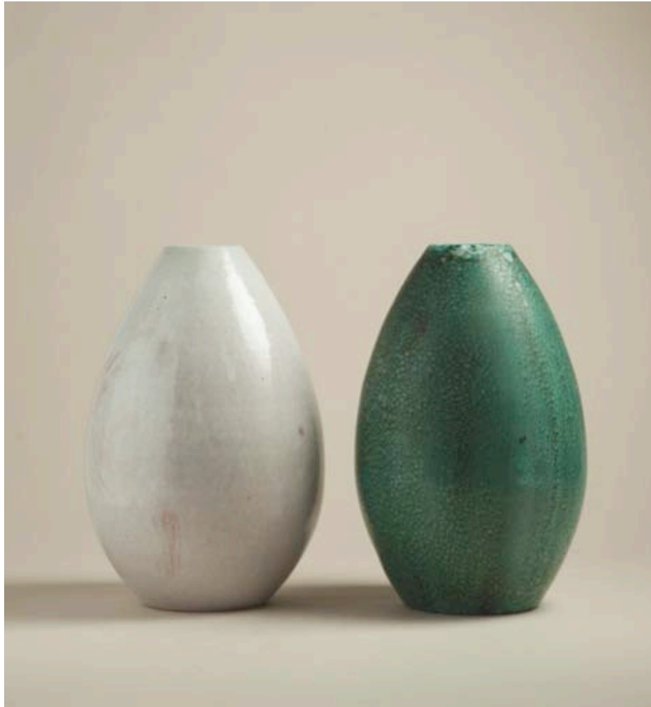
Conic vase, enamelled earthenware c. 1930, Manufacture CAB h 10 \frac{1}{4} in / 17 \frac{1}{4} in