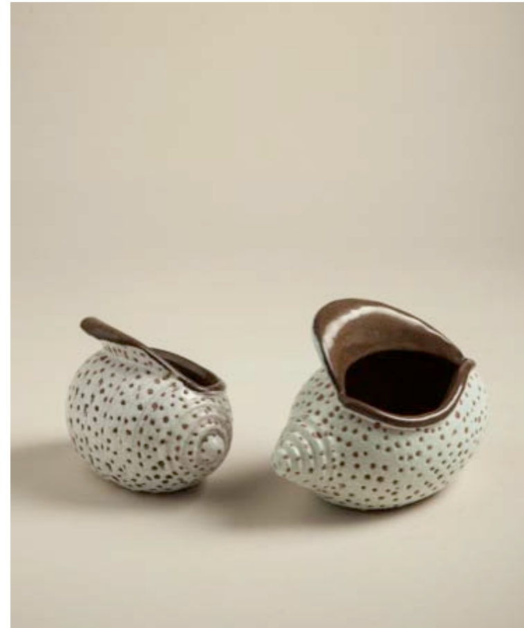
Shells , enameled earthenware c. 1930, Manufacture CAB, Primavera h 6 in / l 8 ¼ in