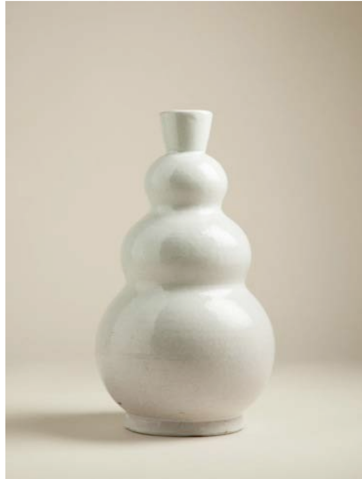
Vase, enamelled ceramic, c. 1930, Manufacture CAB, Primavera h 16 in / 9 \frac{1}{4} in