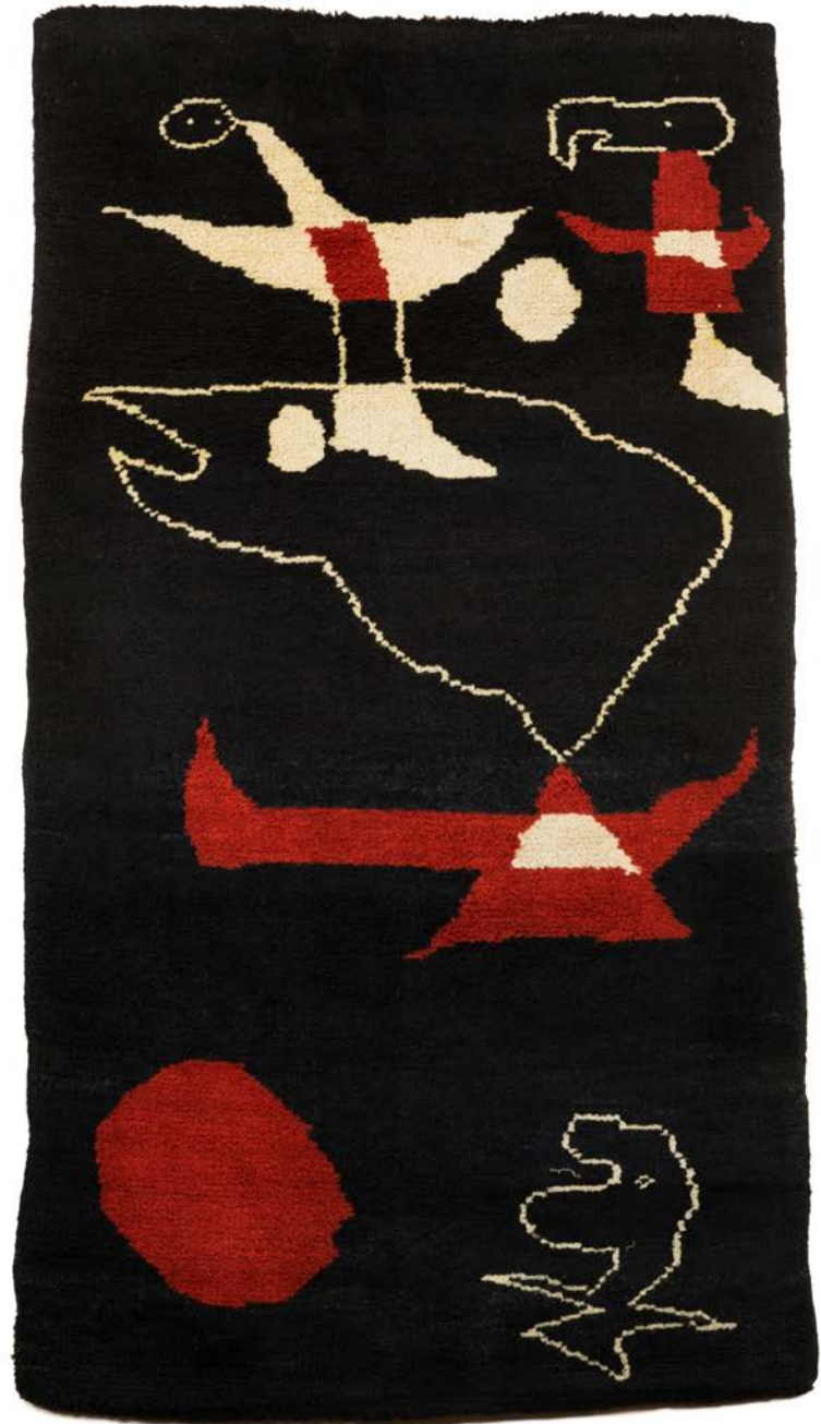
Joan Miró, Maison Myrbor, North Africa , wool rug, c. 1935,