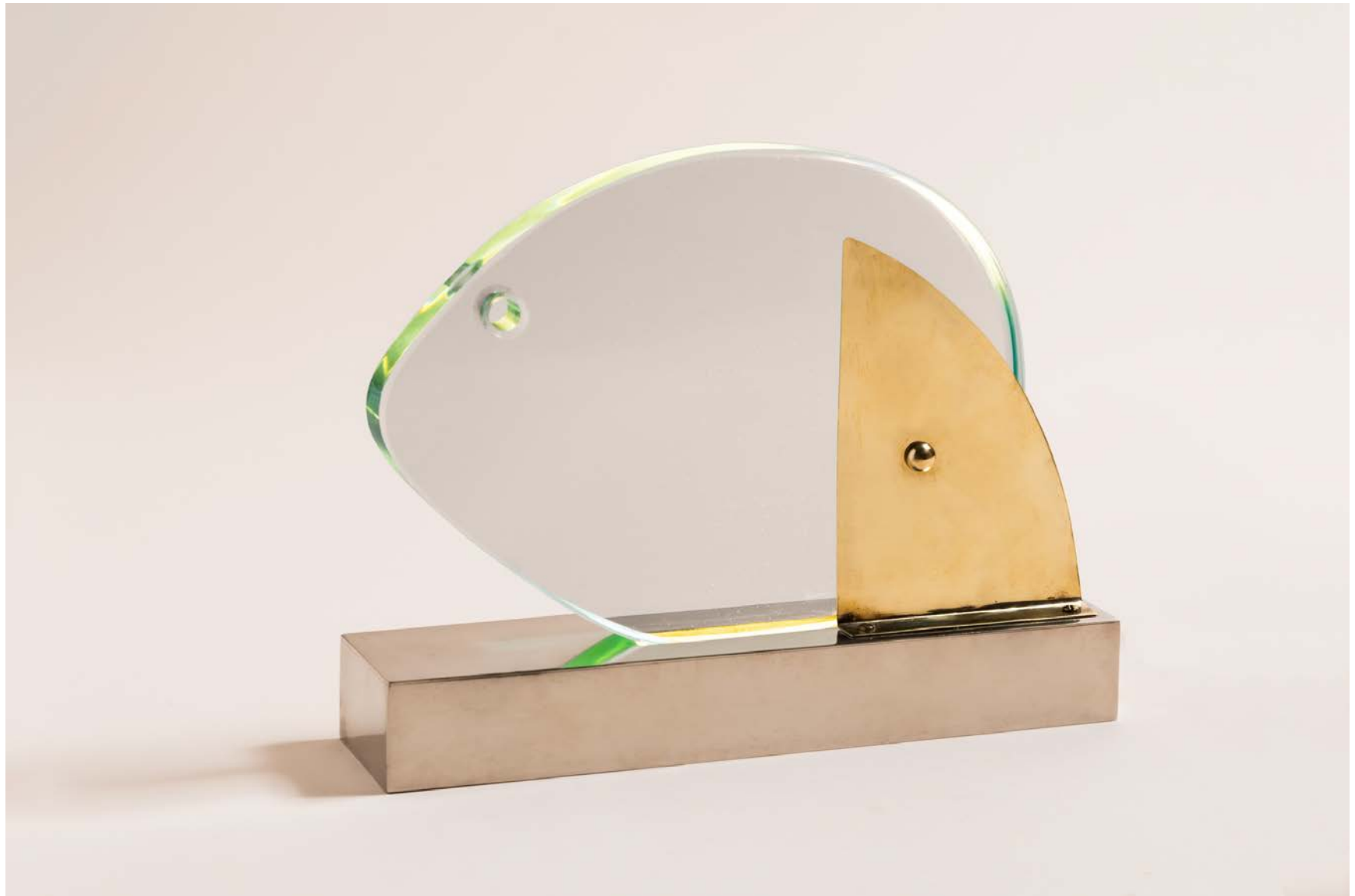
Marcel-Louis Bagniet, Sidelight, Signed and dated 1929, H: 23 cm W: 29 cm.