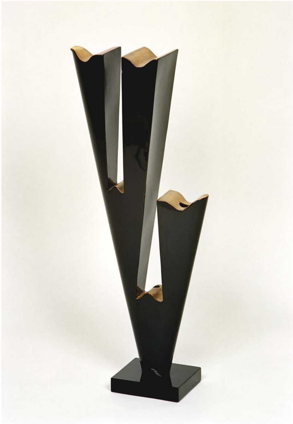
Pierre Dunand, Vase, Laquered metal, Signed, c. 1950, H: 75 cm.