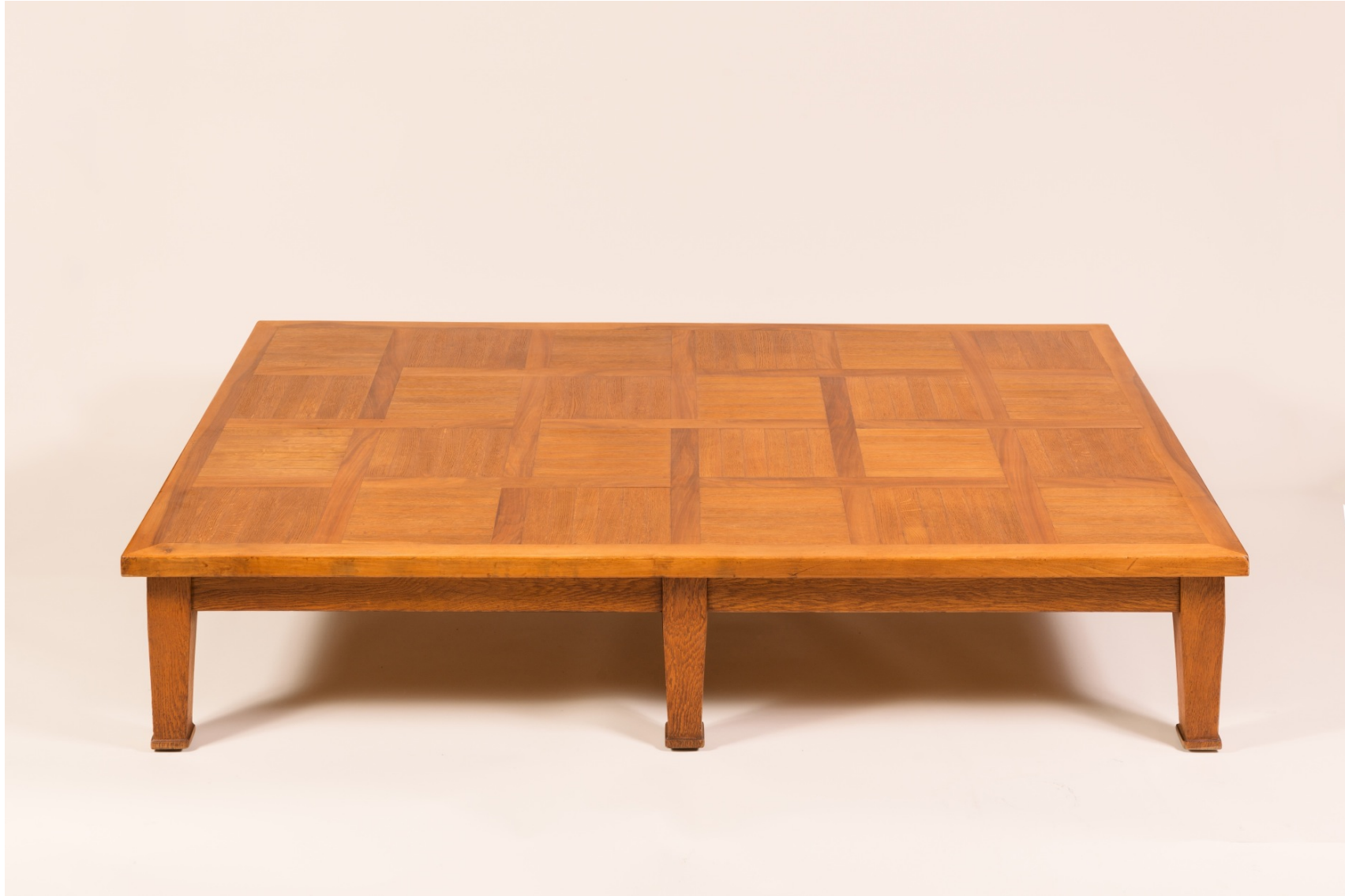
Auguste Perret, Large coffee table, oak, with parquet-style top, c. 1935, L:182 cm L: 123 cm H: 38 cm.