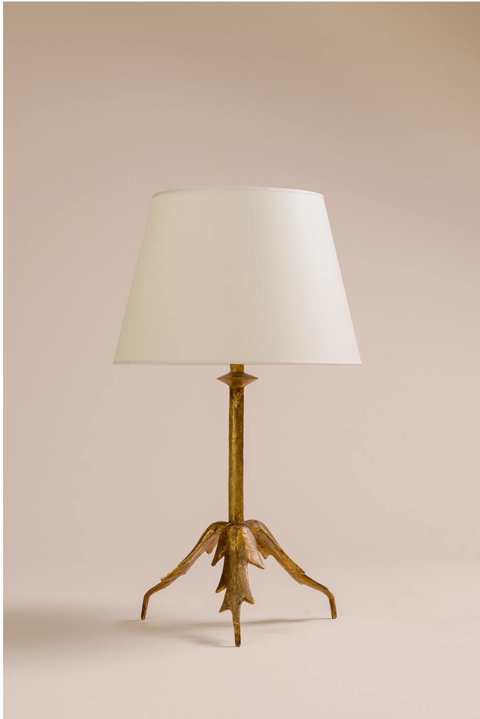
Alberto Giacometti, Tripod table lamp, resting on gilt bronze leaves, c. 1937, H: 39 cm, Certificated by the Giacometti Committee.