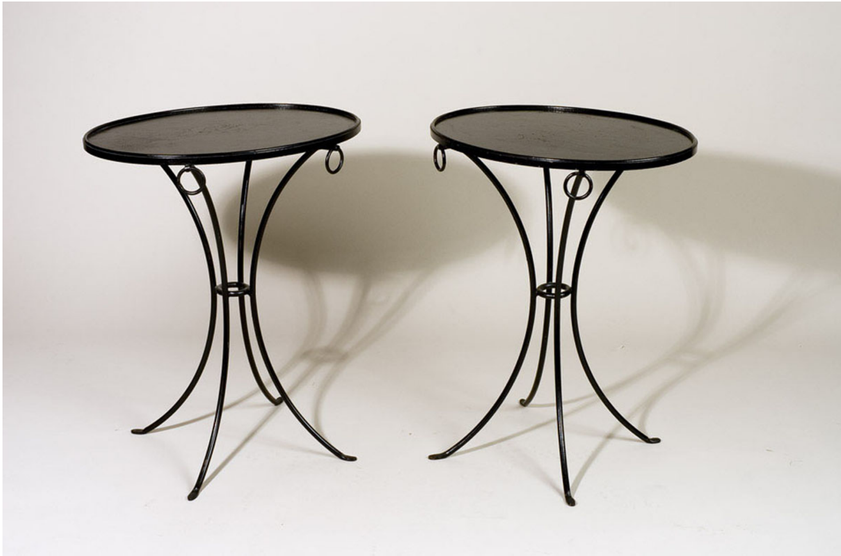
Jean-Michel Frank , Pair of quadripod occasional tables, blackened iron, c.1937, Ø: 49,5 cm H: 66 cm